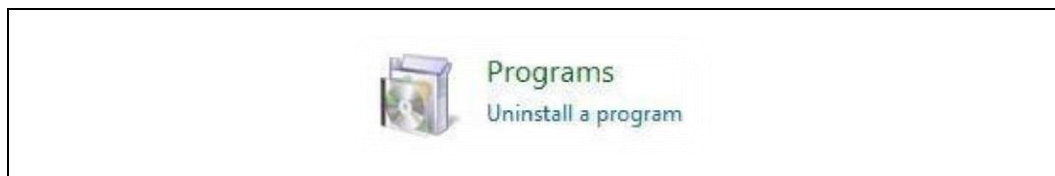
Figure 2. Uninstall a program